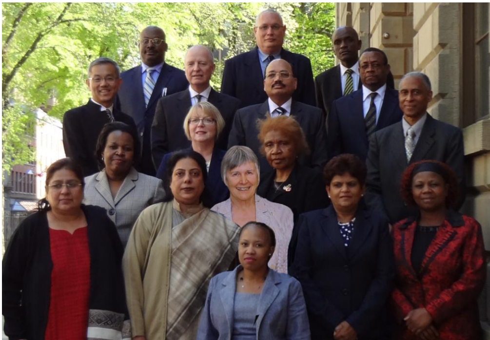
Participants at Province House, Halifax

The evaluations received from the participants were very positive. Many participants commented on the expertise of the facilitators, expressing a desire to delve further into many of the topics covered. Several commented on the usefulness of the materials and discussions, noting that the experience will serve as a solid resource in their home countries and can be adapted to accommodate different legal systems. Specifically, the participants praised the informative and diverse content of the course and felt that their attendance at the Intensive Study Programme would directly improve their ability to face the challenges of judicial education / judicial reform in their home jurisdictions.